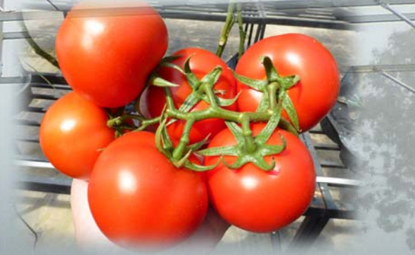
Export Quality Truss Tomatoes