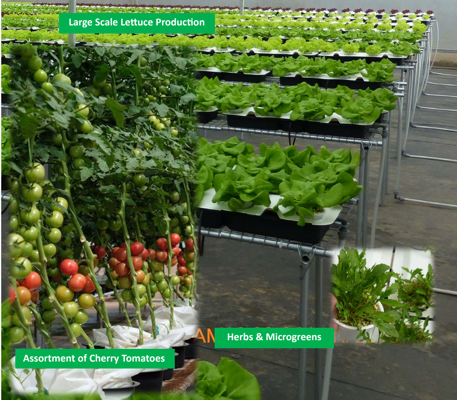
Herbs & Microgreens